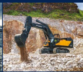
Specifications and design are subject to change without notice. Pictures of Hyundai Construction Equipment Europe products may show other than standard equipment.